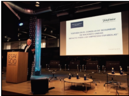
Above: Conference on the future of the European economy. Below: Spanish Minister of Foreign Affairs opening a Choiseul debate.

This April, Mr. José Manuel García-Margallo, Minister of Foreign Affairs of the Spanish Government gave the opening session of a meeting organized by Institute Choiseul Spain at Telefonica Foundation premises. The meeting was held by some 130 senior executives of leading Spanish multinationals, as well as a selected number of foreign ambassadors in Spain. A panel of four people including the CEO of FCC, ITP, CLH and INDRA offered its views about the economic oportunities coming from Spain being a member of the UN Security Council during the period 2015-2016.